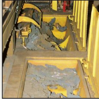
Slagger Blade pushes the slag into the Slag Bucket (optional)