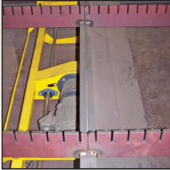
Slagger Blade during the cleaning cycle (Shown moving under a swinging zone divider)