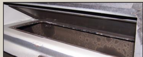
Damper Door Open - Cam active