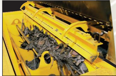
Table Frame and Support Surface: Maximum work piece thickness for the standard table is 4 inches (100mm). Tables for thicker material are available. The table can be any size and corresponds to the cutting capacity of the cutting machine. The table arrives at the end user assembled in modules for final assembly on-site.

Slag Pusher Blade Assembly: Each table is divided into lengthwise bays by the side wall and duct modules. A Slagger unit runs within each lengthwise bay. Each Slagger unit travels the entire length of the table and pushes slag and small parts out of the table into a collection area or an optional slag bucket.