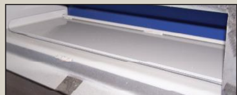
Damper Door Closed - Cam inactive