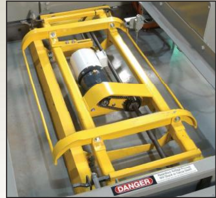
Slagger Pusher Blade Mechanism

The pusher blade is propelled with a positive rack and pinion drive. To clean the table, the operator simply runs the cutting machine into its park position, which sets the safety circuit. The Slagger drive is then turned on, moving the pusher blade unit forward, pushing the slag ahead of it. Utilizing a unique design, the Slagger pusher blade opens and passes under each of the downdraft zone swinging dividers automatically as it passes along. Once the Slagger has passed, the swinging divider returns to its vertical position to restore the smoke removal airflow capability during cutting. When the unit reaches the end of the table, the slag is pushed outside of the table for disposal.